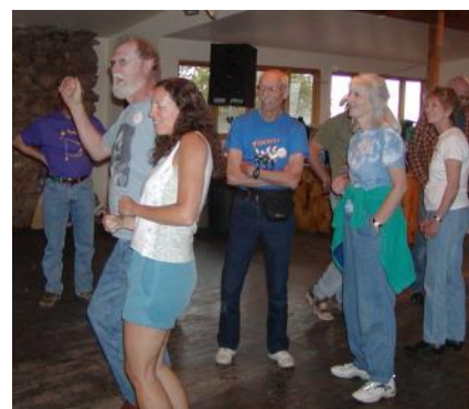
Cajun dance workshop