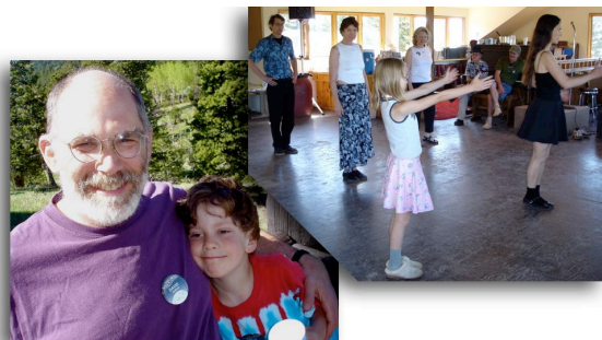
Loving Kids & Kids Teaching

Kids 12-15 are required to lead 1 one-hour kid's workshop, or spend one hour taking care of the younger kids during an evening dance. Both parents and older kids must sign up to lead these workshops on the registration form. A detailed follow-up letter will be sent to all parents.