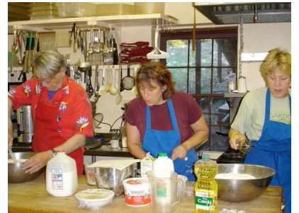
Help in the kitchen. 37 teaspoons of ...?