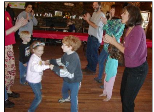
Kid's dance workshop