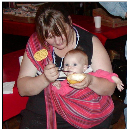
First Moon Festival

GO through town. Take the left fork at the fire station. Continue 1/3 mile out of Gold Hill. The ranch is on the left.