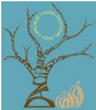
design by Ellen Thompson design shown on Oceana