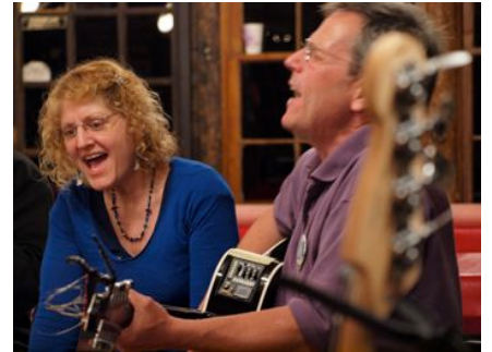
Evening fireside singing.