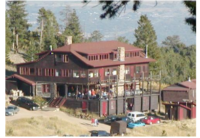
Colorado Mt Ranch Lodge