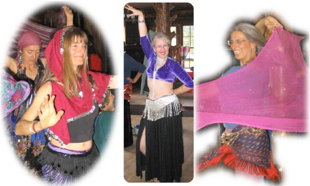
Bellydance workshop and talent show performance