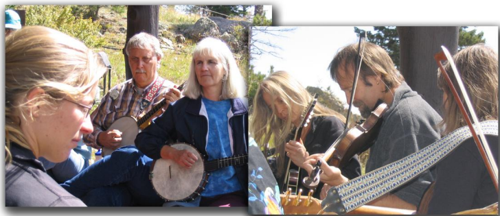
Jamming on the porch

Accommodations are co-ed, dorm style cabins with bunk beds (first come, first served), or bring a tent for camping. Room provided for women only in one of the cabins.